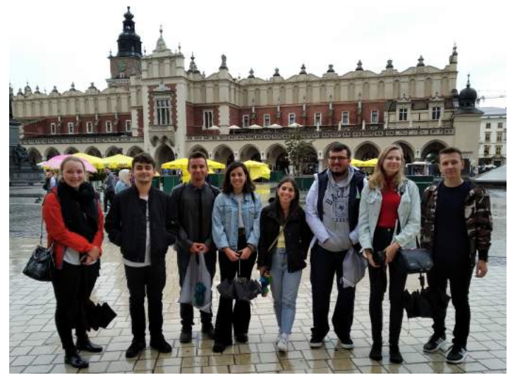
Welcome Days- City Game, 26th September 2020

Due to the current epidemic situation, the final number of students who will come to the Ignatianum may change.