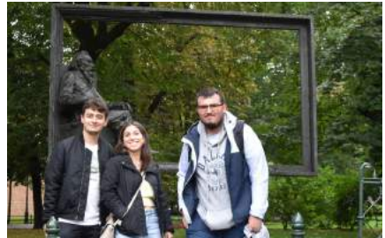
Welcome Days- City Game, 26th September 2020