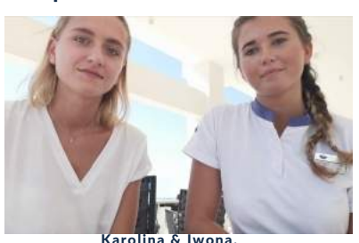
Tourism and recreation students